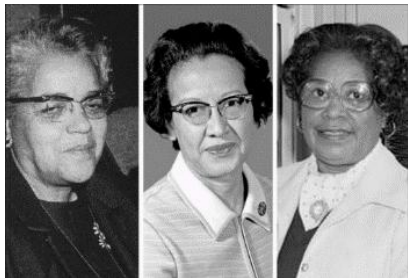
Dorothy Vaughan, Katherine Johnson and Mary Jackson

Women were all crucial in 'The Space Race' due to their math work at NASA