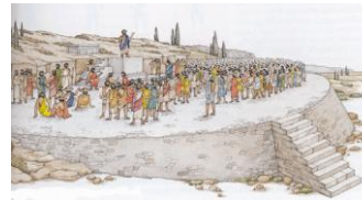
Pnyx, next to the Parthenon, where democracy began