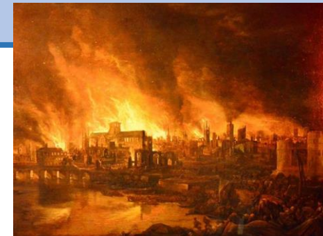
Great Fire of London- 1666