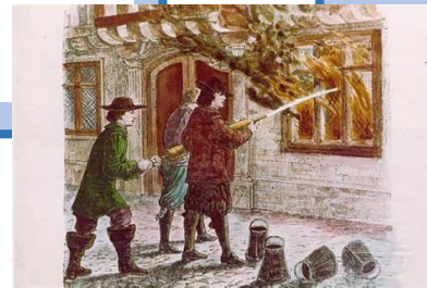
Items to put out a fire in 1666