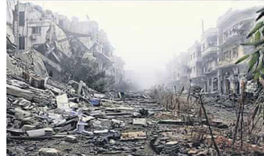
Syria before and after War