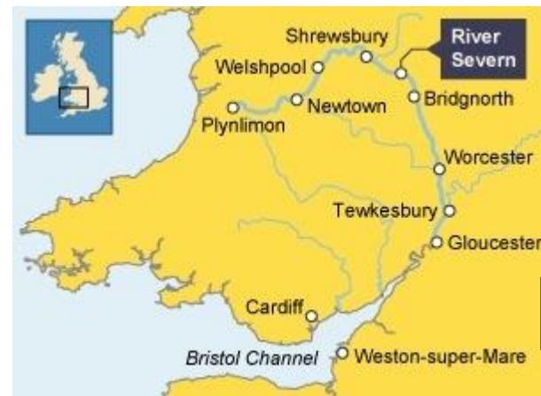
Journey of the River Severn