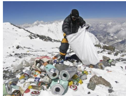
Negative impacts of tourism